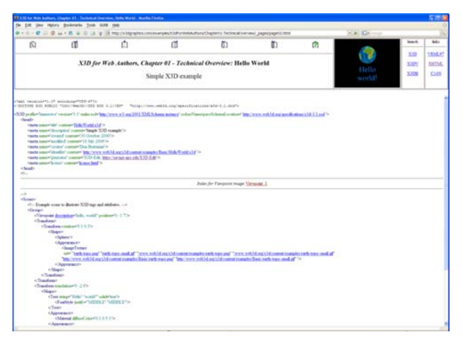
Figure 4. HelloWorld.x3d is one of many hundreds of example scenes that are accessible and explorable via any web browser with an X3D plugin installed.